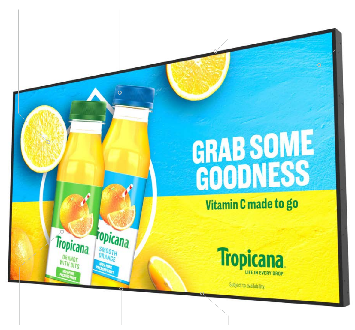
SUPER HIGH CONTRAST RATIO